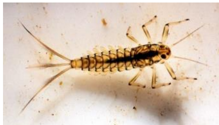
Denizens of the Kennet (see p.22 and in colour online)