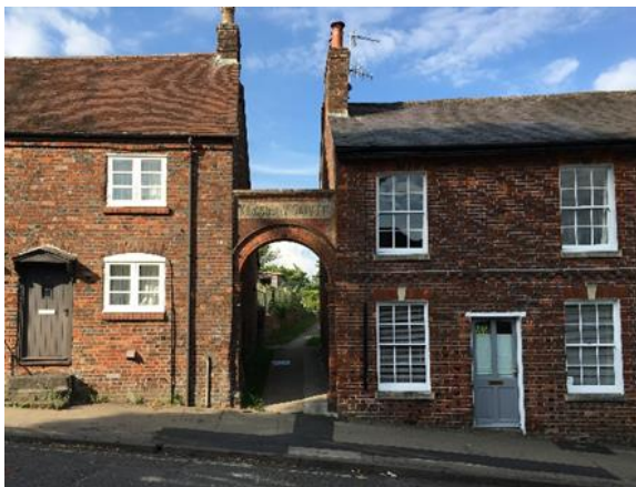
Entrance to Kingsbury Square from Kingsbury Street

[A longer version of this article is available in the extended online edition]