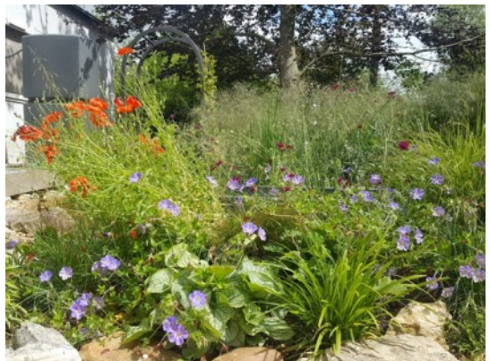
Figure two: rain garden at Baydon Primary School, managing rain water and brightening the playground

If you'd like to see rain gardens ARK has built in local schools, designed for us by Wendy, there are some fine examples at Preshute, Ramsbury, Aldbourne, Shalbourne, Baydon and Chilton Foliat Primary Schools. All of them manage rain water and have some good ideas to copy at home.