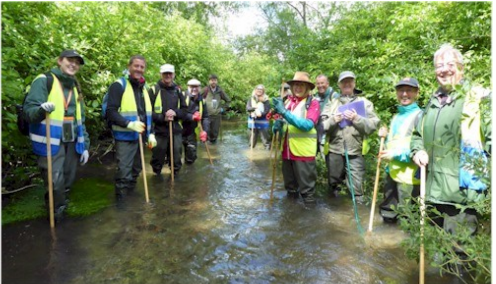
Water vole surveyors