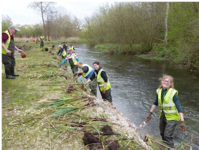
ARK volunteers planting up the river bank