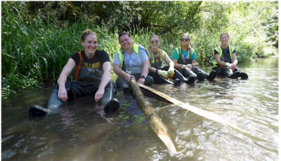
Adam Matthew Digital staff taking part in a corporate volunteering day