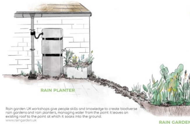
Figure 1 – Elements that make up a rain garden. You can choose one or all of them, depending what suits you.

A 'Rain garden' is a planted depression in the ground that harnesses the power of soil and plants to capture rain, filter out pollution and then let the water soak slowly into the ground. Some rain gardens include rain water planters, which are specially designed planters that contain a reservoir to store rain water before slowly releasing it back to the drainage network or to the ground. Finally, a good rain garden will include some sort of water butt to hold on to rain so it's available for dry spells.