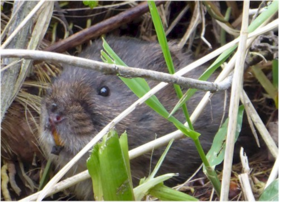
Water vole, River Kennet