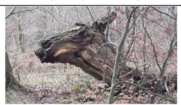
Savernake Forest Monster.

https://www.britannica.com/topic/writing/Sumerian-writing