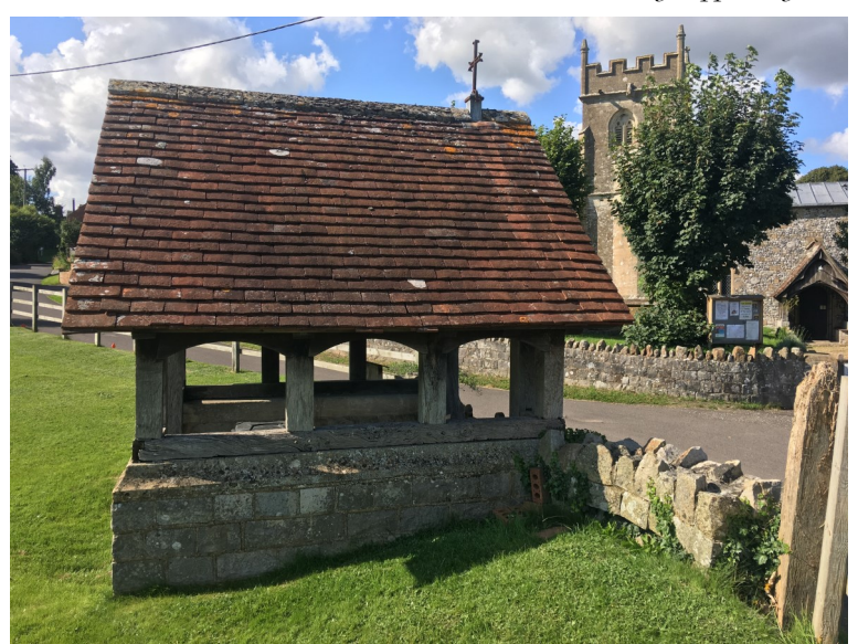
Village War Memorials: Fyfield Lychgate