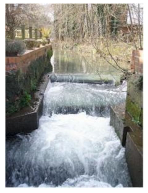
Town Mill Trout Ladder