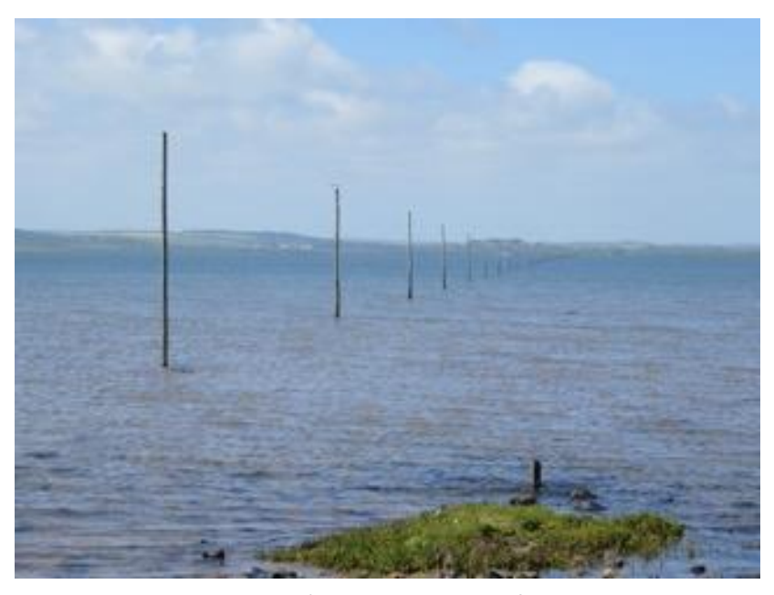
The Pilgrim's Causeway, Lindisfarne. The path that joins the island to the mainland is cut off by the tide twice a day.

The sabbatical was interesting and I appreciated the time for study and reflection. If any group, Church or not, would like to hear more I am happy to come and talk about my sabbatical studies.