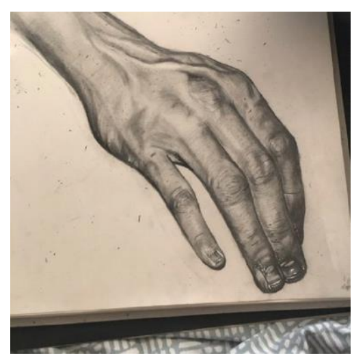
Isaabella Paxton (year 13)