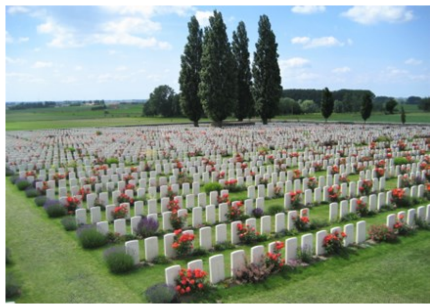
Tyne Cot cemetery on the slopes of the Passchendaele ridge