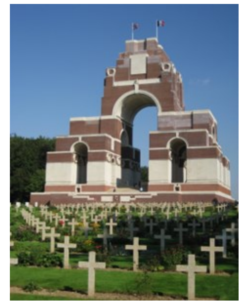
The Thiepval memorial to the Missing of the Somme