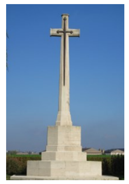
The Cross of Sacrifice