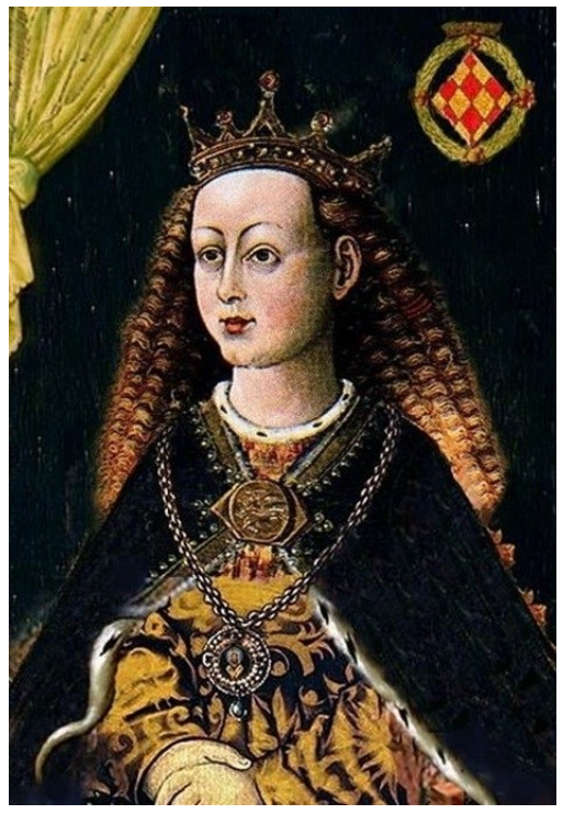
Isabel of Angoulême (see pages 7 and 8)