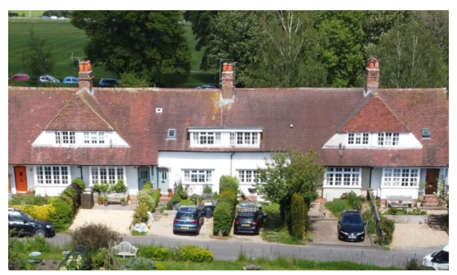
13 to 18 St John's Close

Terrace. I was lucky enough to find estate agent's particulars for one of the houses in Pixmore Way. Its layout and original features are replicated in our house and others in the terrace. Neighbours became similarly interested in the links between St John's Close and Pixmore Way, carrying out additional research, both in Marlborough and Letchworth.