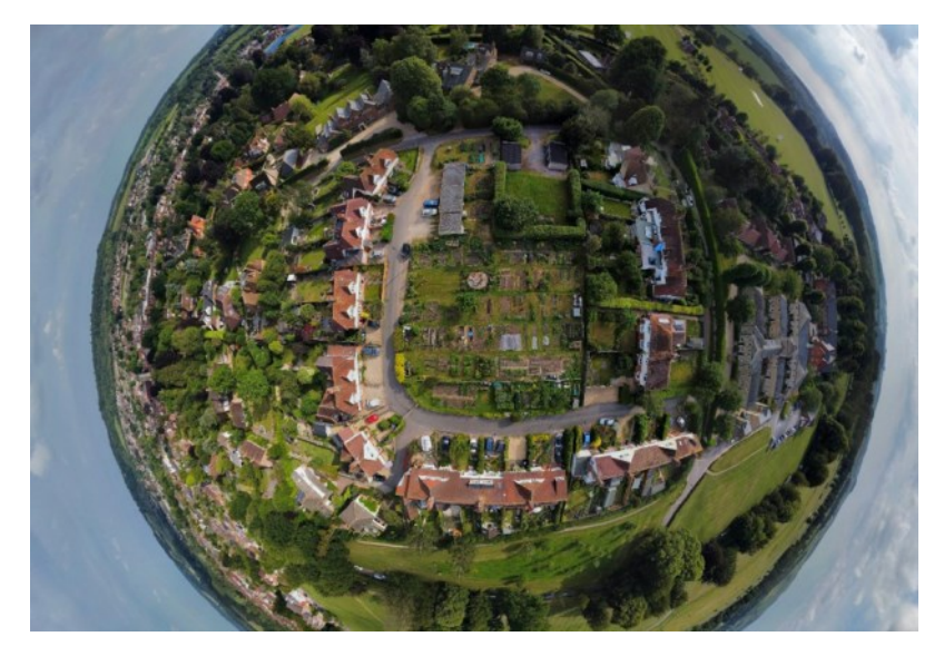
Drone photo of St John's Close

Improvements have been carried out to most of the houses; bathrooms were added to many of the dwellings only as recently as the 1960s. Several have had extensions, and most new building work has adhered to the style of the original Arts & Crafts design, so the character remains. The result is a mix of owneroccupied and tenanted housing, a mix of dwellings suitable for families, for single people and couples, leading to a harmonious community such as envisaged by Ebenezer Howard over a century earlier.