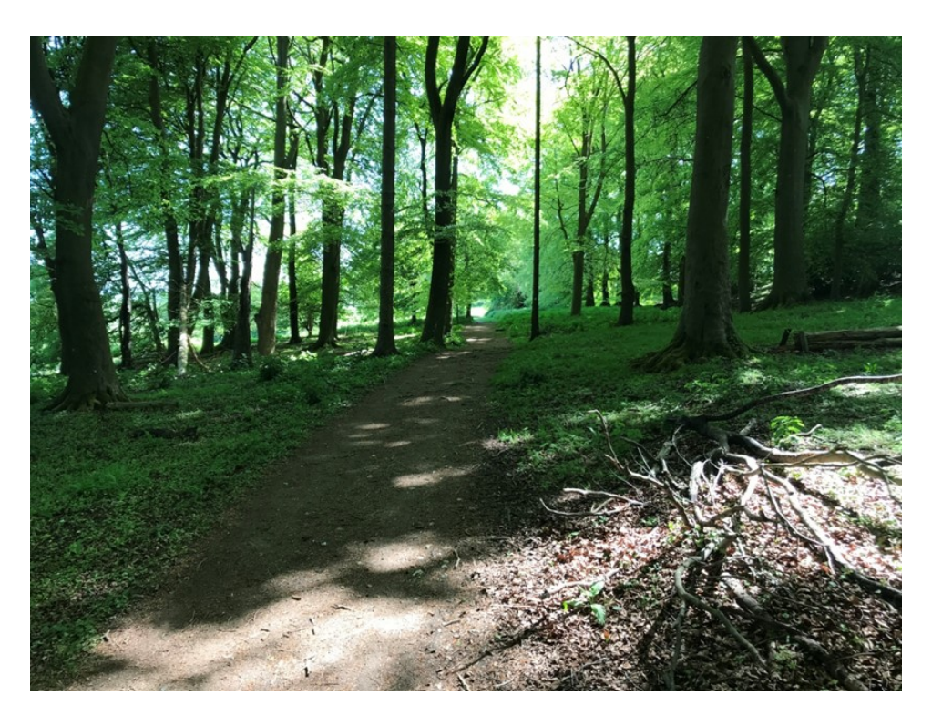
Looking East through the beech wood at the top of Granham Hill Heading South-West up the path to get onto Granham Hill past tree number 24 (oak)