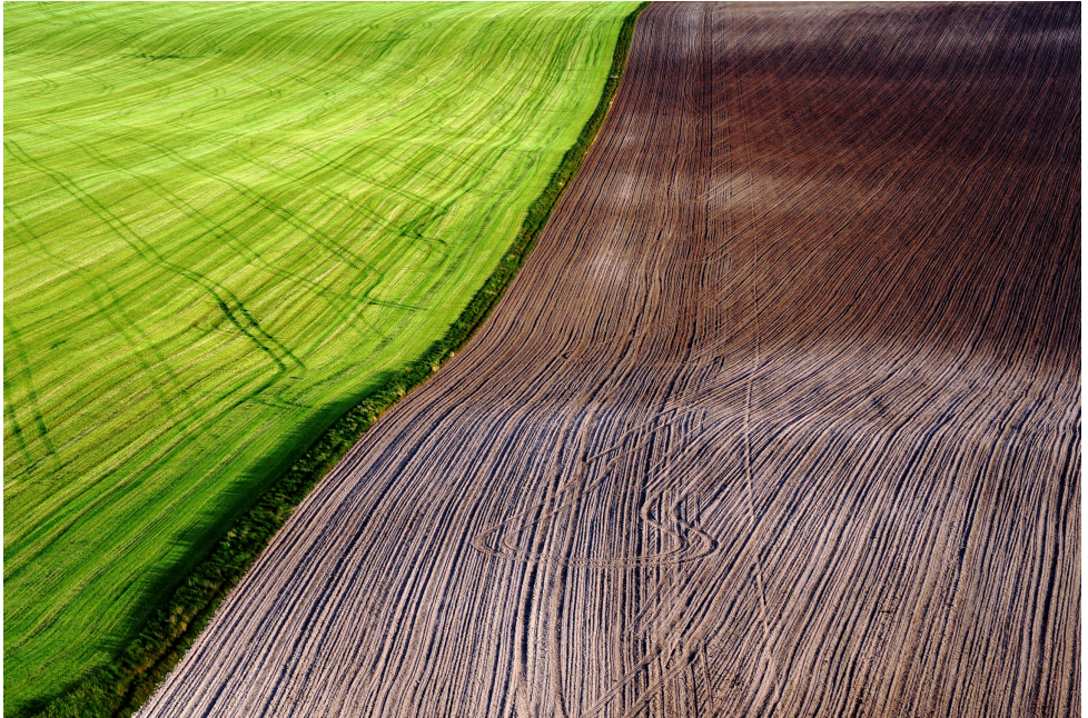
Spring Fields from Knap Hill