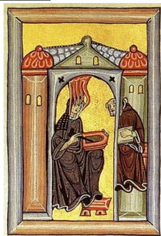
Illumination from the Liber Scivias showing Hildegard receiving a vision and dictating to her scribe and secretary.