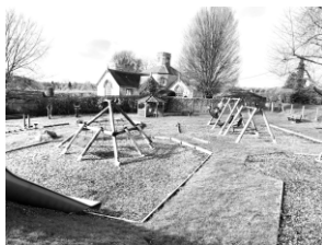
Minal playground with Old School House