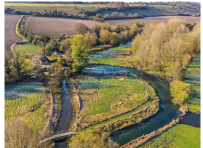
Bends at the Bothy