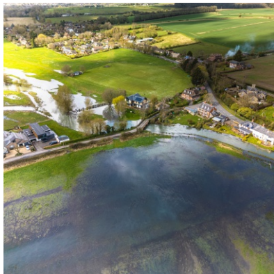
Kennet in flood 01/24