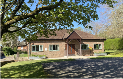
Minal Village Hall and Commemorative Plaque

of events, including the monthly Minal Munch—an opportunity for the community to drop in for a chat, a snack and a drink. The hall also provides the setting for the annual Produce Show, Barn Dance, Bingo, and the Christmas Nativity Play, among others.