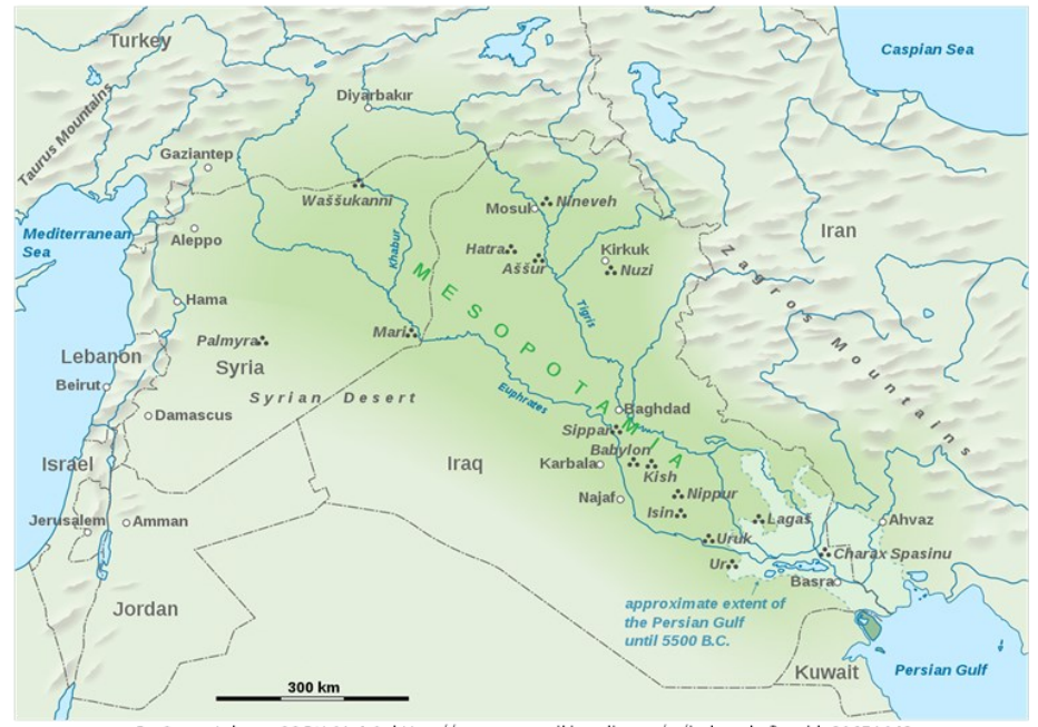
By Goran tek-en, CC BY-SA 4.0, https://commons.wikimedia.org/w/index.php?curid=30851043