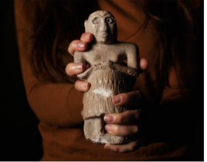
Fig.10wning the Past (Sumerian Statue)

A number of projects have taken place over the last few years to help develop and shape the narratives in the gallery. This includes a temporary exhibition called Owning the Past: From Mesopotamia to Iraq which explores the history of how ancient objects from Iraq came to the Ashmolean in more detail than will be possible in the permanent gallery. Crucially, it highlights the impact that these events have had and continue to have on the lives and identities of people from the Middle East. The approach is part of a museum-wide strategy designed to proactively address issues