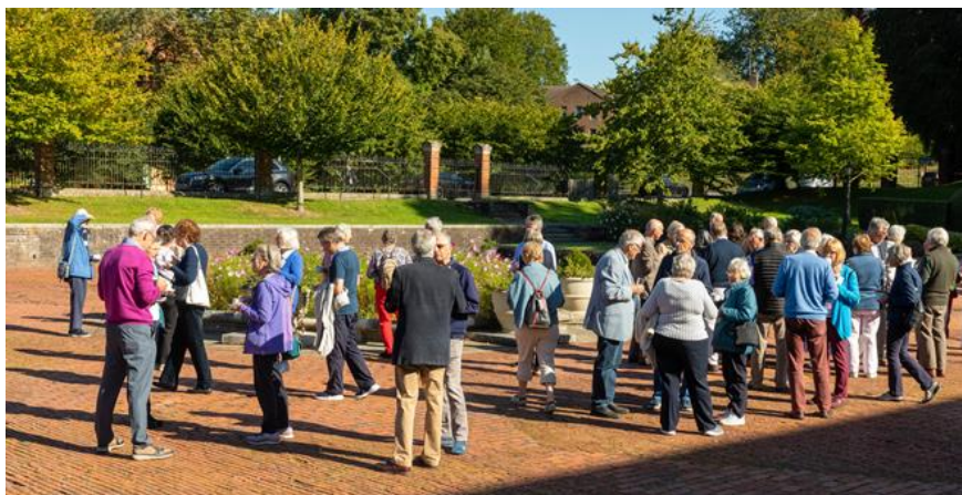
Coffee break outside the Memorial Hall